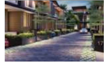
Internal Landscaped Roads